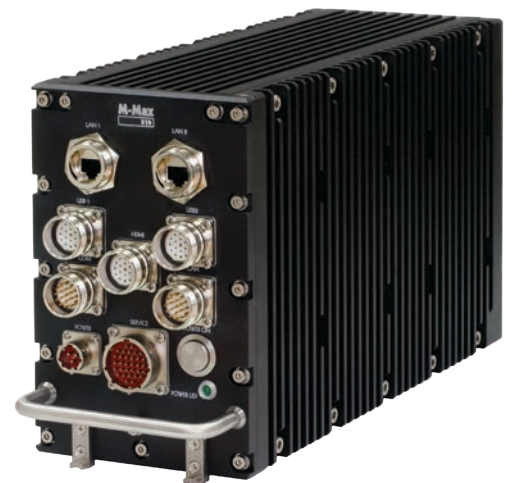
M-Max 810 EP/MMS

Providing shock and vibration protection, the M-Max 810 EP/MMS can operate under extreme temperatures (-40 to +55 °C), dust and humidity. Delivering excellent performance due to the Intel Core i7 CPU (2.1-3.0 GHz), it also features excellent 2D and 3D graphics capabilities via VGA and HDMI interfaces. Data storage options include vibration proof industrial SSDs with RAID functionality (software or hardware option).