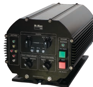
M-Max 700 ST/NRC

The M-Max 700 ST/NRC is a specialized computer designed for use in transport. It is equipped with a large number of isolated digital and analog input/output ports. The front panel is fitted with a display and controls defined by the customer.