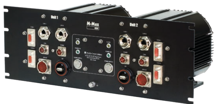
M-Max 820 EP/USO

Providing shock and vibration protection, the M-Max 820 EP/USO can operate under extreme temperatures (-40 to +55 °C), dust and humidity. Delivering excellent performance due to Intel Core i7 CPUs (2.1-3.0 GHz), it also features excellent 2D and 3D graphics capabilities via VGA interface. Data storage options include vibration proof industrial SSDs with RAID functionality (software or hardware option). The computer is used as a part of a safety system at railroad and operate as an optical time-domain reflectometer.