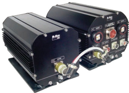
M-Max 700 ST/IFT

The M-Max 700 ST/IFT system consists of two units – a system unit and a battery unit. The system unit is a standard M-Max 700 with military-type connectors on the front panel. MicroMax modified the I/O subsystem and connectors and integrated two customer supplied PCI boards, which involved extensive engineering work. The UPS subsystem consists of an intelligent charging device which is housed in the system unit and two battery modules housed in the battery unit. The battery unit provides the system with 4 hours of backup power.