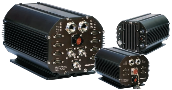
M-Max 700 PR/TTI

M-Max 700 PR/TTI — This pair of computers is designed for use in a vehicle's data acquisition system. The mobile unit is installed in a vehicle and the land-based unit is given stationary installation. The system has a video capture CVBS, CAN interface, an expanded set of RS-232/422/485 ports, and digital I/O. Each unit has a built in super-capacitor based UPS. The units are built to operate in extremely harsh environments.