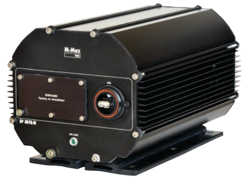
M-Max 700/CR mk.3

The M-Max 700/AR is designed for installation on locomotives and other railway vehicles to record signals from a continuous Automatic Train Control (ATC) and Interlocking systems, directly from a sensor (inductive coil) mounted under a pilot of a locomotive, location-bounded by GPS.