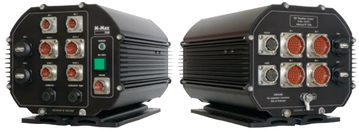
M-Max 700 ST/PLT