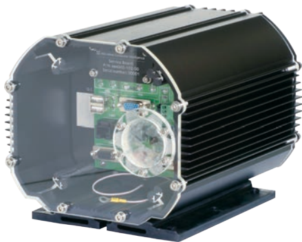
M-Max 800 EP2/PLT

The M-Max 800 EP2/PLT is designed for rapid deployment of customized systems having their own sets of PCI-104 expansion boards and external connectors. The base platform is equipped with an integrated heating system and allows installation of additional heating systems for customer boards. The platform can be equipped with a service board having connectors for all installed interfaces and indicator options, and it supports an optional transparent front panel allowing access to the connectors for visual monitoring of system operation during chamber testing. A light version of the platform, M-Max 800 EP2/FL , is developed to house twice more I/O expansion boards (up to 4).