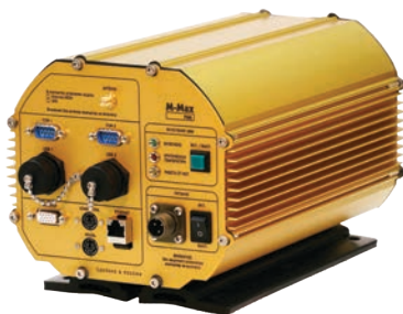
M-Max 700 ST/GZR

The M-Max 700 ST/GZR is a rugged transport on-board computer. Evolved from an earlier version, it has been upgraded with: