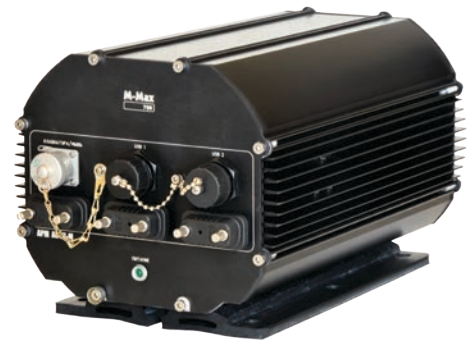
M-Max 700/ARM mk.4

The following are MicroMax products that were customized to satisfy specific end-user requirements. They demonstrate MicroMax's experience and ability to develop similar specialized systems. We have a portfolio of previous designs that can be quickly and efficiently adapted to new uses, for example, with updated component elements. We welcome your inquiries about needs.