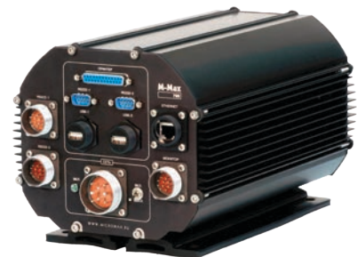
M-Max 700 Performance