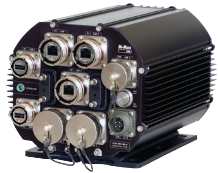
M-Max 800 EP2/TRN-02

This compact unit fits in a small space and features operation at an extended temperature range of -40 to +65 °C without any fans or active cooling. It uses MicroMax patented thermal technology to dissipate heat from internal circuit boards. The M-Max 800 EP2/TRN-02 has 5 LAN Gigabit Ethernet, 1 RS-232 and 3 USB 2.0 ports. Data storage options include vibration proof industrial SSDs with RAID functionality (software or hardware option). No competitive units in the high-performance ruggedized computing market offer these features.