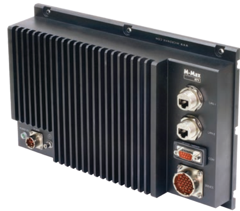
M-Max 871 EP2/MMS

Rugged high performance computer for tough environments. The M-Max 871 EP2/MMS enclosure is designed according to VITA75 footprint and can be mounted in tough environments on different vehicle types. Lightweight compact sealed case with patented fanless heat dissipation resists contamination and humidity. Providing shock and vibration protection, the M-Max 871 EP2/MMS can operate under extreme temperatures (-40 to +65 °C). Computing power in the high-end desktop class.