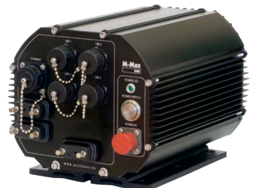
M-Max 800 EP1

The M-Max 800 EP1 is a rugged high performance computer for tough environments. Sealed case with patented fanless heat dissipation resists contamination and humidity. The system is IP65 rated and configured with Intel Core i7 (up to 2.9 GHz) CPU. Computing power in the high-performance desktop class.